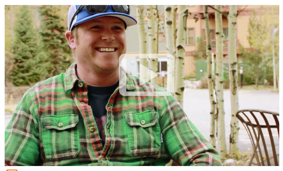
When you love teaching and love your sport, others love you for the energy and enthusiasm and skill you share with them. With PSIA-AASI, you're not just living life; you're creating a way of life that others share too.