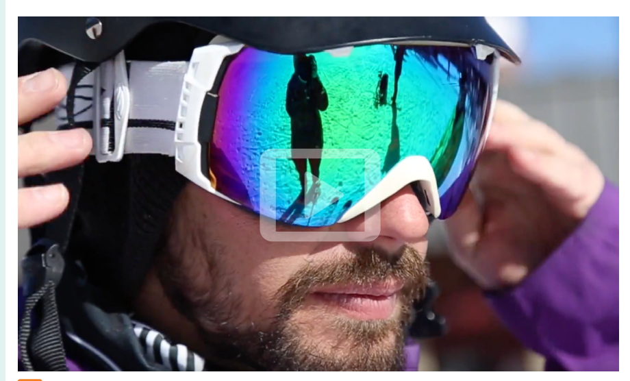
Watch this video to learn more about PSIA-AASI.

Expand your knowledge and crush certification exams by using cutting-edge teaching and technical manuals available at great member prices through the PSIA-AASI Shop.